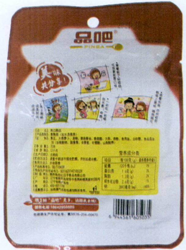
Figure 2. Unregistered PINBA Tasty Brittle Cucumber (In Foreign Language)