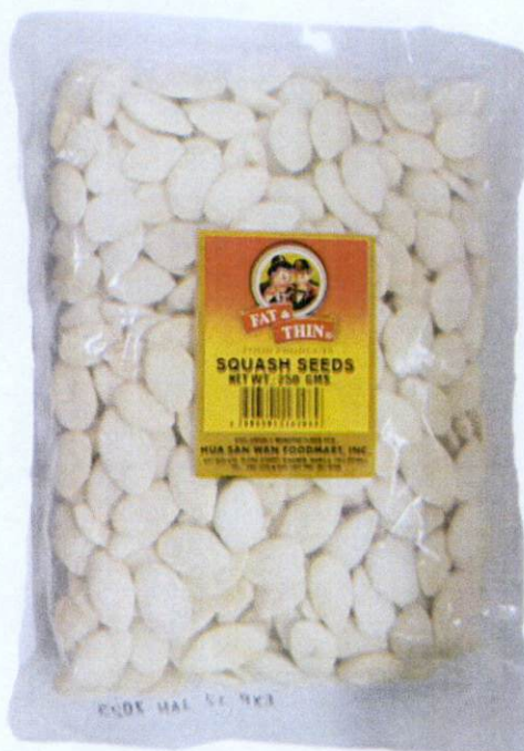
Figure 1. Unregistered FAT & THIN FOOD PRODUCTS Squash Seeds

The Food and Drug Administration (FDA) warns all healthcare professionals and the general public NOT TO PURCHASE AND CONSUME the following unregistered food products: