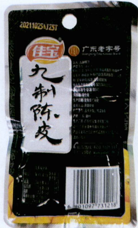
Figure 3. Unregistered GUANGDONG TIME-HONORED BRAND Food Product with Image of Tangerines in Black Vacuum Sealed Packaging (In Foreign Language)