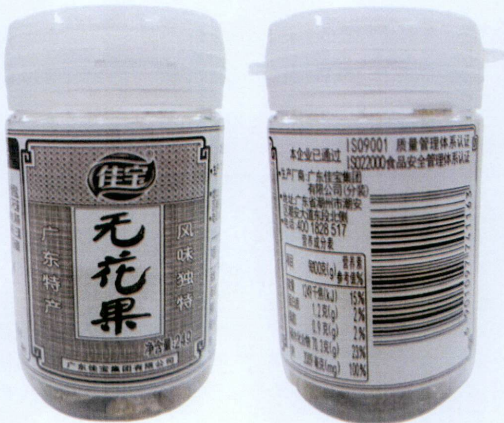
Figure 5. Unregistered Food Product in White and Brown Labeled Plastic Container (In Foreign Language)