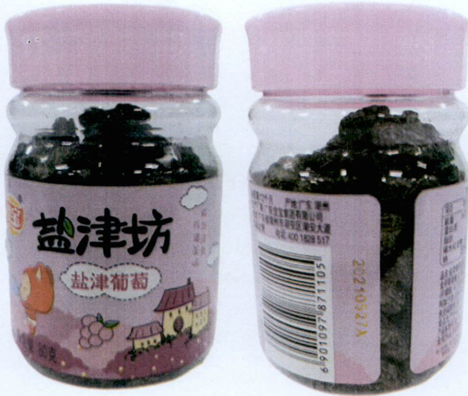
Figure 4. Unregistered Food Product in Purple Labeled Plastic Container (In Foreign Language)